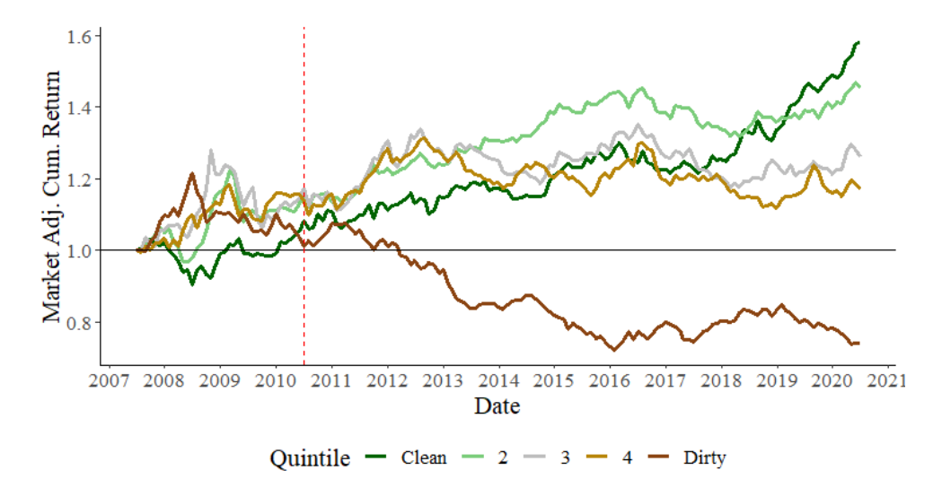
Figure 1: Market adjusted cumulative returns of the carbon intensity-sorted, value-weighted quintile portfolios in the period from 07/2007 to 06/2020.